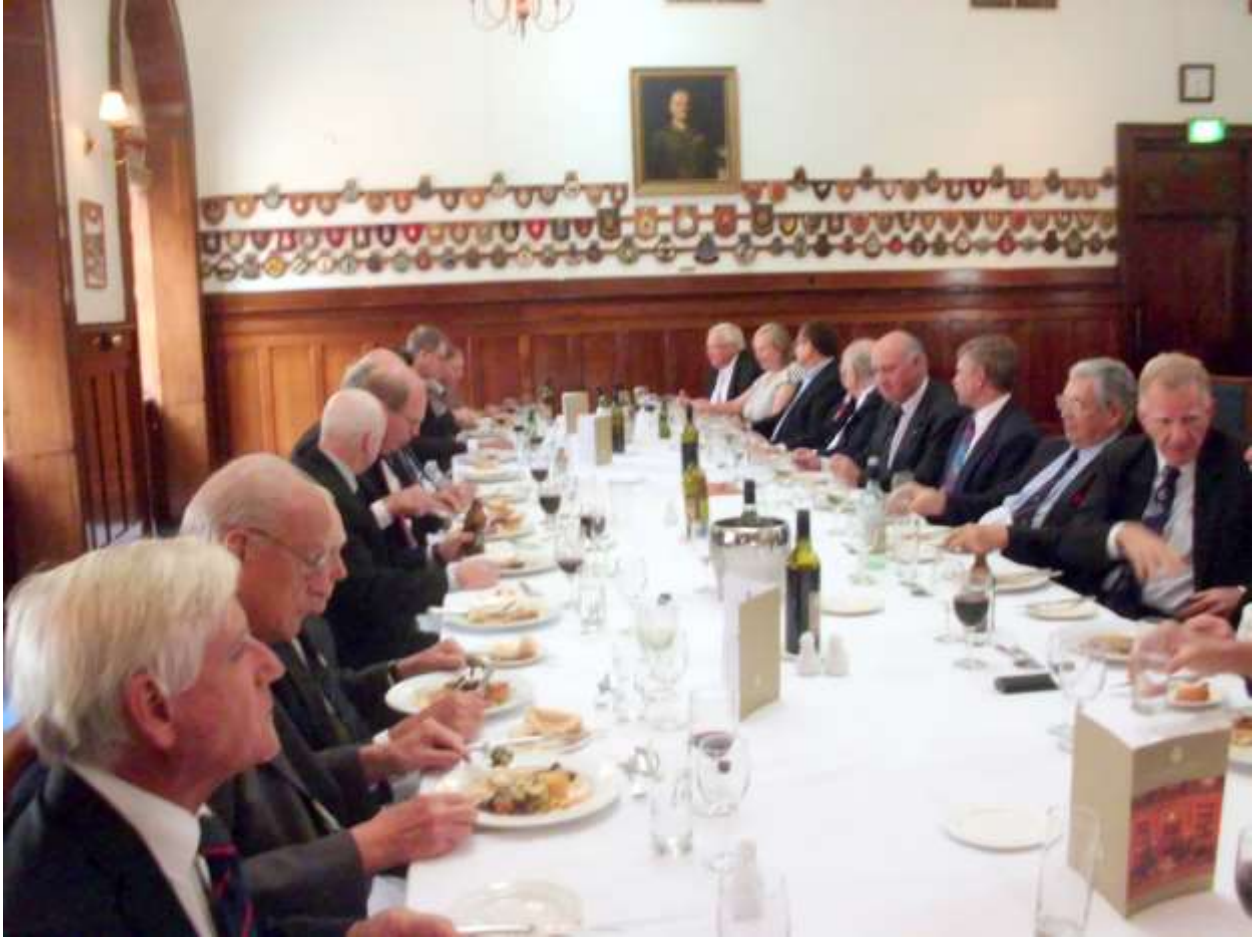
UNSWR Association Christmas Lunch, Royal Automobile Club, Sydney, Friday 5th December 2014.

For more photographs at the Christmas Lunch, please go to the Association website at http://www.unswr.com.au/Page7.php